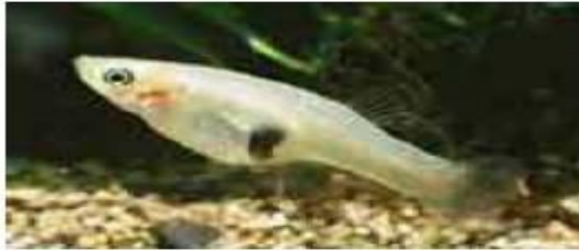
MOSQUITO FISH ( Gambusia affinis )

Whenever possible, Vector Control Technicians release Gambusia fish to eat the mosquito larvae. This reduces the need for larvacides and adulticides.